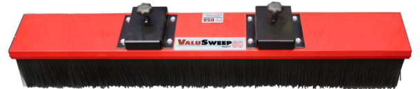
VSB-060 60" PUSH BROOM