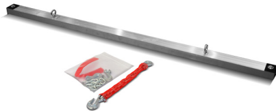
VMB-048-1/VMB-060-1 MAGNET KIT

Picks up nails and other metallic objects. Available for 48" and 60" models.