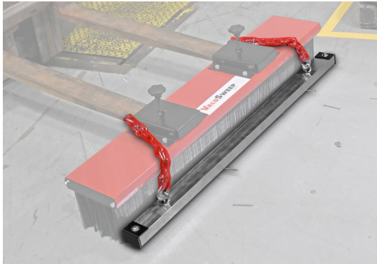
VSB-048 Broom shown with optional VMB-048-1 Magnet Kit.