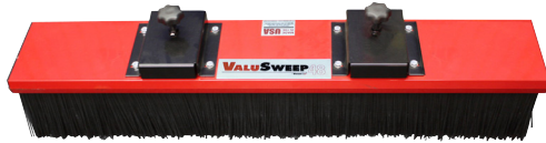
VSB-048 48" PUSH BROOM